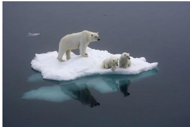
Melting ice caps